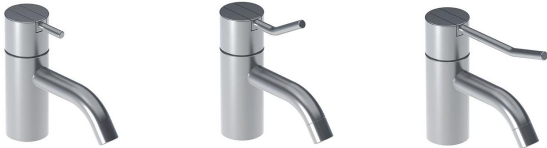
Figure 1: HV1, HV1M, and HV1L