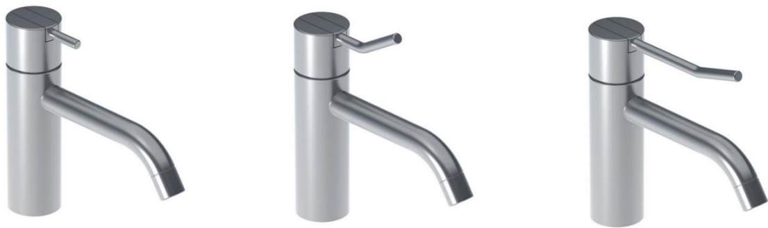
Figure 4: HV1+30/150, HV1M+30/150, and HV1L+30/150

Twelve products (HV1, HV1/150, HV1+30, HV1+30/150, HV1L, HV1L/150, HV1L+30, HV1L+30/150, HV1M, HV1M/150, HV1M+30, HV1M+30/150) are calculated in six different surface groups (16 and 20, 19, 40, 27, 60, 64), see Figure 1, Figure 2, Figure 3, and Figure 4.